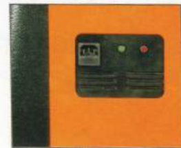
Integrated charger facilitates easy and reliable charging