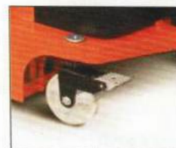
Safe parking in any situation with mechanical parking brake.