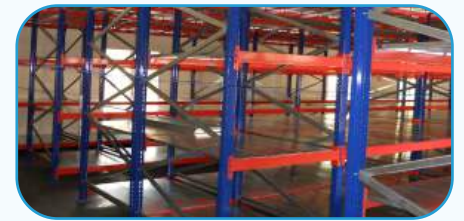
Multi Tier Long Span Shelving Rack