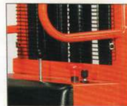
Precise lifting and lowering via hand lever